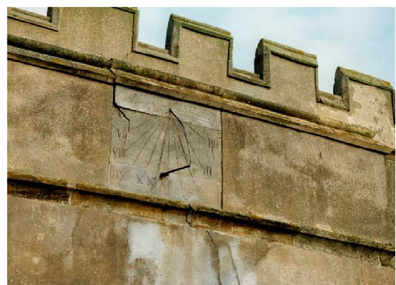
- and as it used to be 1994